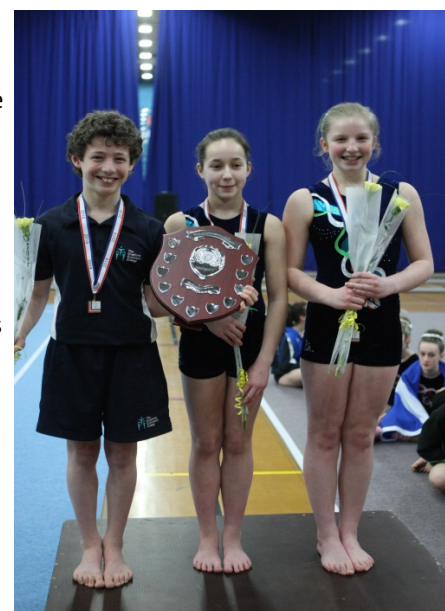
Milano School U 16 Mixed Team Champions Chalfont Community College

sueh54@me.com This approach will speed up the event and avoid problems often experienced using discs. You will still be required to bring discs for back-up purposes.