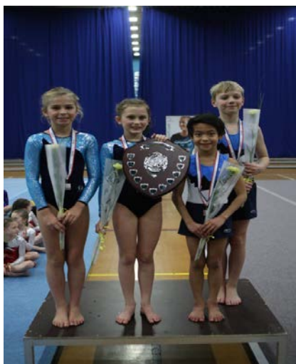
Milano School U 11 Mixed Team Champions Hornsby House

11 MAY BSGA Acro Tumbling and Floor and Vault National Final Fenton Manor