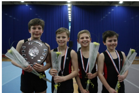
Milano School U 11 Boys Team Champions Chalfont St Peter

A meeting has been planned for all trampoline representatives on the week-end of 10 th -11 th May at the Gala in Coventry. Unfortunately we are unable to avoid the clash of dates with the BSGA AGM.