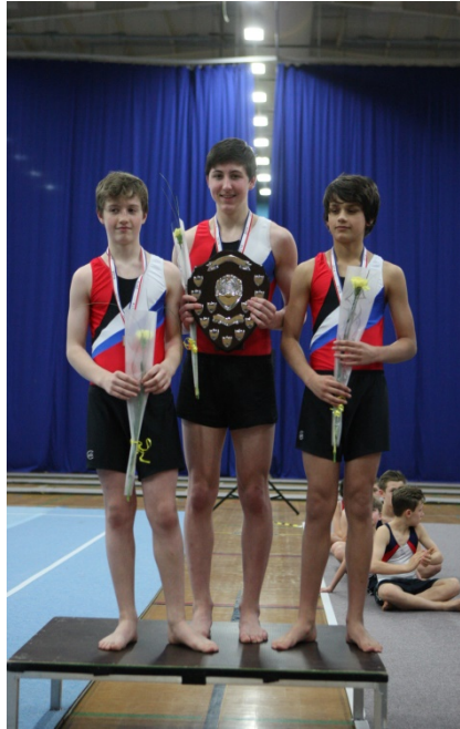
The Royal Grammar School Newcastle Under 16 Boys Milano Team Champions