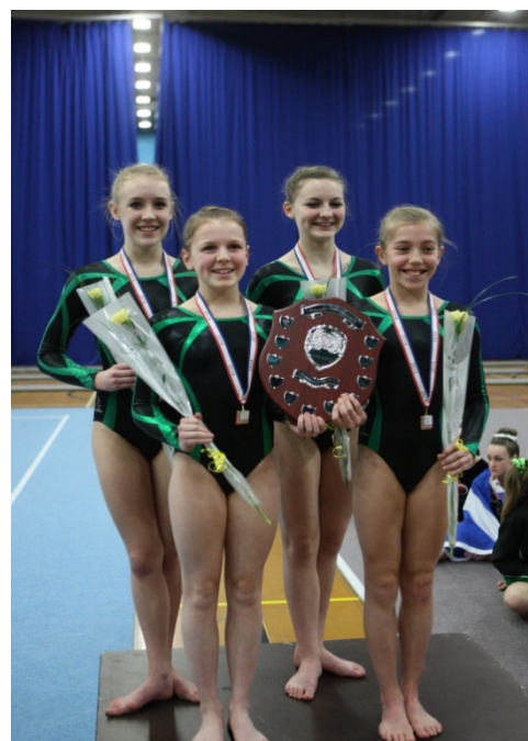
Milano School U 16 Girls Team Champions Tonbridge Grammar School