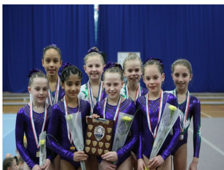
Regional Milano Team Champions Under 11 Girls The South